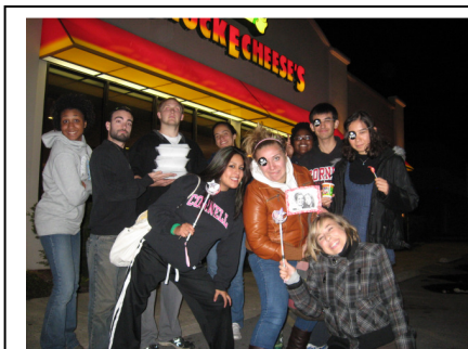
Akwe:kon residents on the Fall 2008 Akwe:kon House Retreat.

- For more information on Akwe:kon's symbolism, visit: http://www.aip.cornell.edu/cals/aip/student-life/akwekon/symbolsand-meanings.cfm